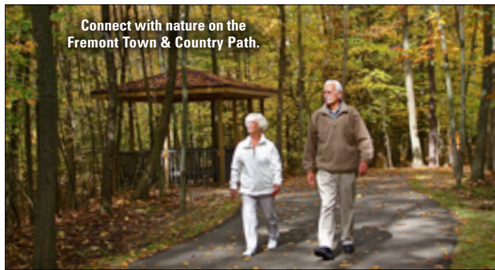
Connect with nature on the Fremont Town & Country Path.