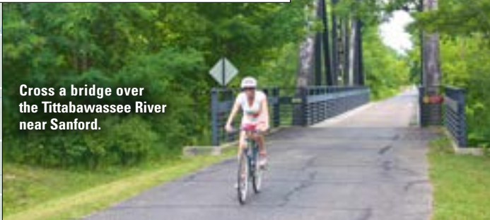
Cross a bridge over the Tittabawassee River near Sanford.