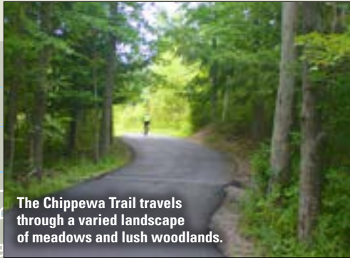
The Chippewa Trail travels through a varied landscape of meadows and lush woodlands.

Like to add a few more scenic miles to your trail adventure? In Midland, you can cross "The Tridge" to ride along the 3.7-mile Chippewa Trail, a non-motorized, paved pathway that meanders through the Chippewa Nature Center. Interpretive signs along the way tell the story of this unique landscape.