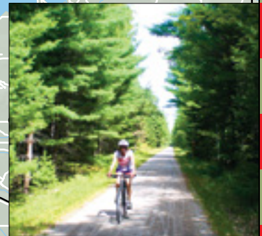
Pass through a forest of white pines between Indian River and Topinabee.