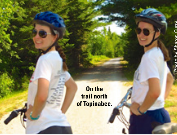
On the trail north of Topinabee.