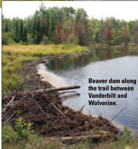
Beaver dam along the trail between Vanderbilt and Wolverine.

When you reach Marina Park in downtown Indian River, you've traveled 28.2 miles, the mid-point of the North Central State Trail. Indian River is uniquely located between Mullet and Burt lakes and the Indian and Sturgeon rivers. Marina Park offers a great staging area for both trail users and boaters with a marina, restrooms, drinking water, ample parking and close proximity to restaurants, shops and lodging.