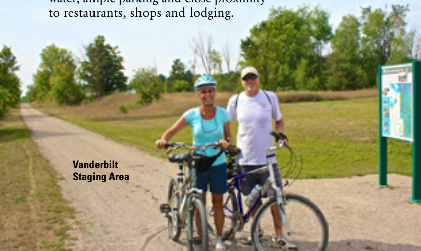
Vanderbilt Staging Area