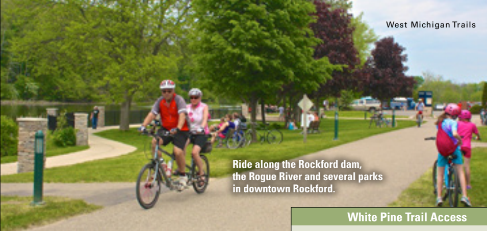
Ride along the Rockford dam, the Rogue River and several parks in downtown Rockford.