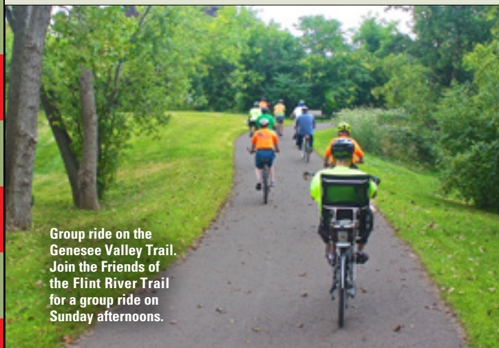
Group ride on the Genesee Valley Trail. Join the Friends of the Flint River Trail for a group ride on Sunday afternoons.

Built on an abandoned railway that once served the epicenter of the automotive industry, the new 4.5-mile Genesee Valley Trail runs from Genesee Valley Center on Linden Road to Chevy Commons near downtown Flint. Chevy Commons is a new city park being developed on the site of the original Chevrolet assembly plant which was demolished several years ago. Completed August 2015, this paved rail trail was built in two phases over five years in collaboration with the city of Flint, the Charter Township of Flint, and the Michigan Department of Transportation. It was thoughtfully designed with HAWK (high-intensity activated cross-walk) signals to provide safe passage across busy city streets. Connected to the Flint River Trail network, it's a great way to add more scenic miles to your ride. This prime connection between a major shopping mall and downtown Flint passes by several good places to stop for ice cream or a bite to eat. For a great day ride, start at Genesee Valley Center and travel north to the village of Genesee and back for a scenic 32-mile round trip ride.