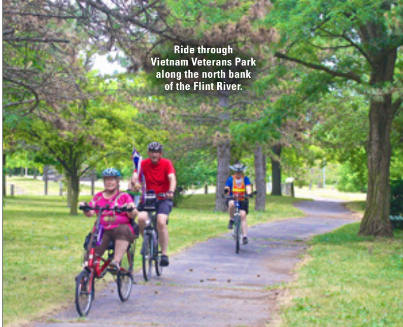
Ride through Vietnam Veterans Park along the north bank of the Flint River.