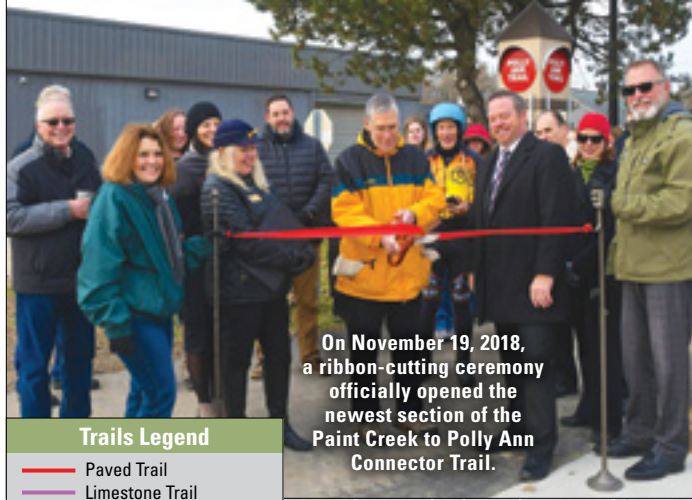
On November 19, 2018, a ribbon-cutting ceremony officially opened the newest section of the Paint Creek to Polly Ann Connector Trail.

The 16.9-mile Polly Ann Trail takes you on a ride through rural northern Oakland County from Orion Township Park to the Lapeer County line. The trail was built on the abandoned Pontiac, Oxford & Northern Railroad that originally ran from Pontiac to Caseville. The trail's name comes from the dubious nickname for