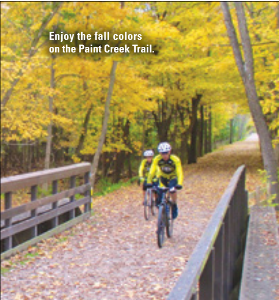
Enjoy the fall colors on the Paint Creek Trail.