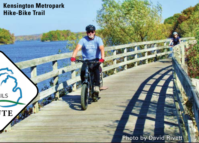
Kensington Metropark Hike-Bike Trail