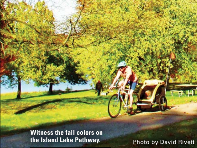
Witness the fall colors on the Island Lake Pathway.