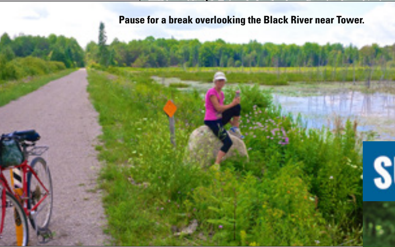
Pause for a break overlooking the Black River near Tower.

©2019 Rockford Advertising. All rights reserved.