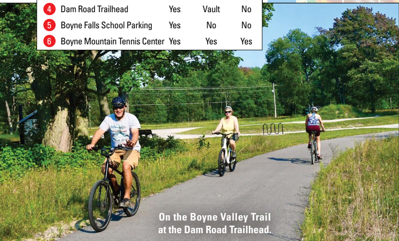
On the Boyne Valley Trail at the Dam Road Trailhead.