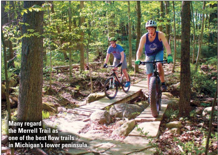
Many regard the Merrell Trail as one of the best flow trails in Michigan's lower peninsula.