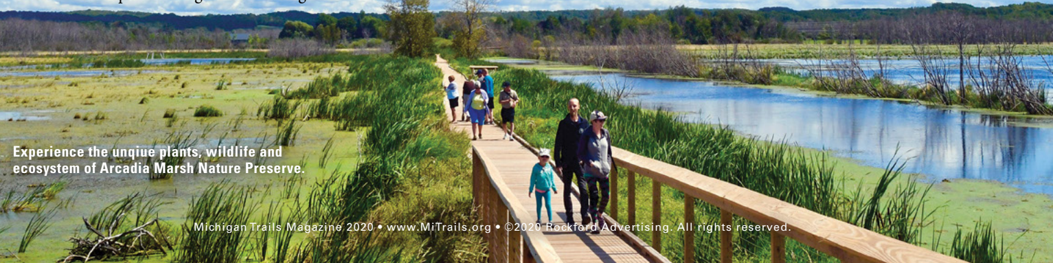
Experience the unique plants, wildlife and ecosystem of Arcadia Marsh Nature Preserve.