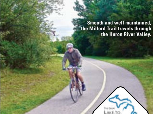
Smooth and well maintained, the Milford Trail travels through the Huron River Valley.