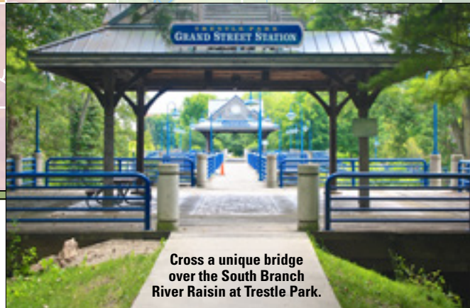
Cross a unique bridge over the South Branch River Raisin at Trestle Park.