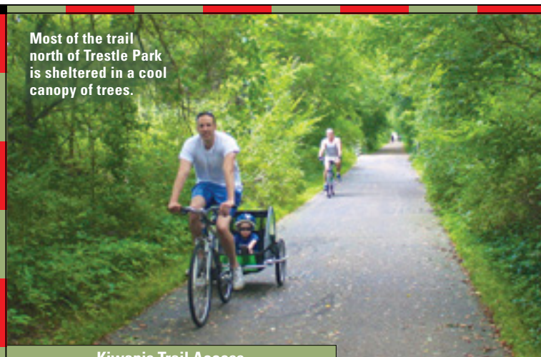
Most of the trail north of Trestle Park is sheltered in a cool canopy of trees.