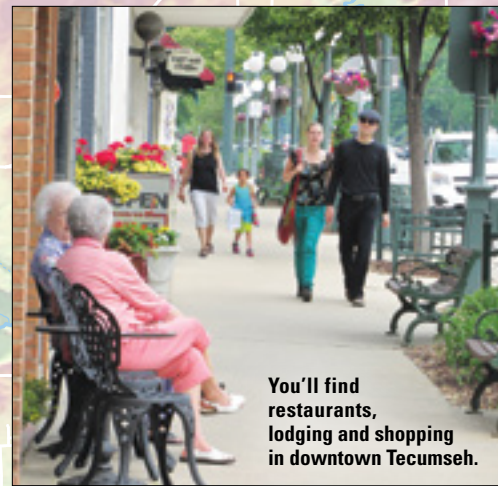
You'll find restaurants, lodging and shopping in downtown Tecumseh.