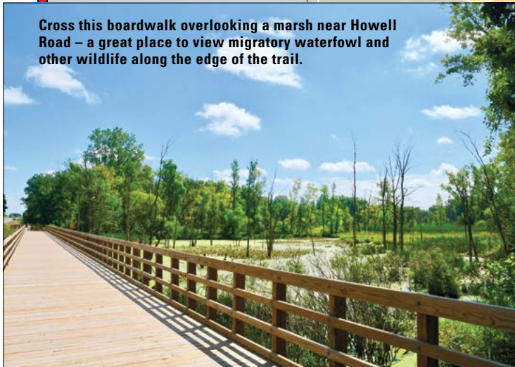
Cross this boardwalk overlooking a marsh near Howell Road – a great place to view migratory waterfowl and other wildlife along the edge of the trail.