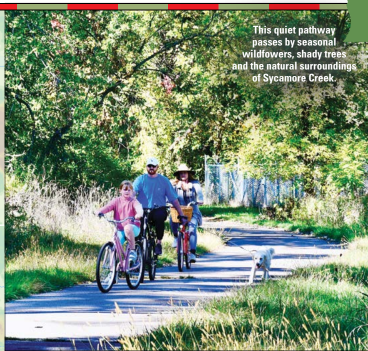
This quiet pathway passes by seasonal wildflowers, shady trees and the natural surroundings of Sycamore Creek.