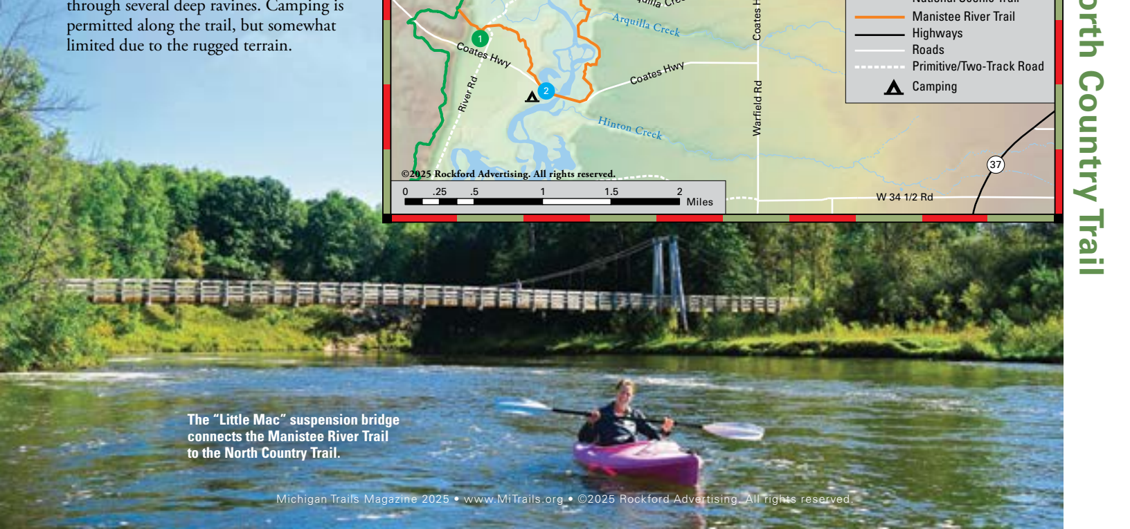
The "Little Mac" suspension bridge connects the Manistee River Trail to the North Country Trail.

Manistee River Hiking & Water Trail • North Country Trail