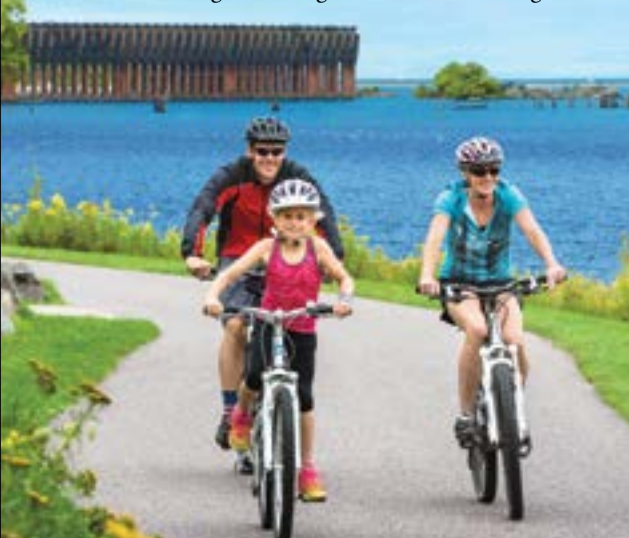
See Marquette's historic ore dock as you ride along the Lake Superior shoreline.

The inland loop of The Path begins at Hawley Road and wraps around the Northern Michigan University campus on its way south. The southern end of the City Multi Use Path connects with the South Trails Trailhead of the Noquamnon Trail Network, where you will find access to more than 30 miles of great hiking and mountain biking trails.