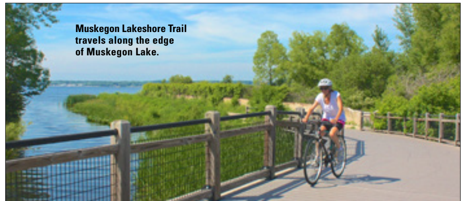
Muskegon Lakeshore Trail travels along the edge of Muskegon Lake.

The 4-mile Laketon Trail is an important connector that links the Muskegon Lakeshore Trail to the Musketawa Trail. It was built on an abandoned rail bed that runs parallel to Laketon Avenue. To connect with the other trails at either end, you must ride along some city streets. To connect with the Muskegon Lakeshore Trail, head west on Southern Avenue and north on Division Street. To connect with the Musketawa Trail, ride south through the industrial park to the trail entrance just north of East Sherman Boulevard on Black Creek Road.