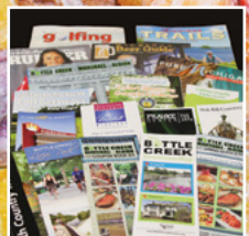
INFO & MAPS