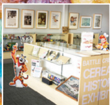
CEREAL HISTORY EXHIBIT

Learn more at www.battlecreekvisitors.org • 269-962-2240