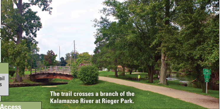
The trail crosses a branch of the Kalamazoo River at Rieger Park.