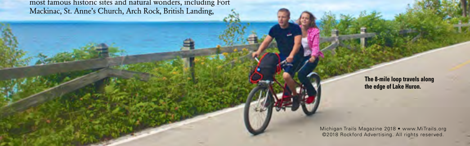
The 8-mile loop travels along the edge of Lake Huron.