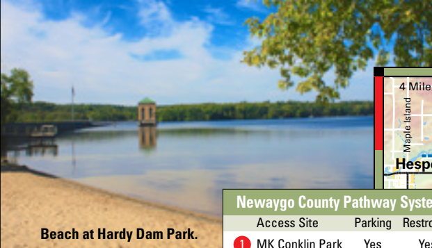
Beach at Hardy Dam Park.