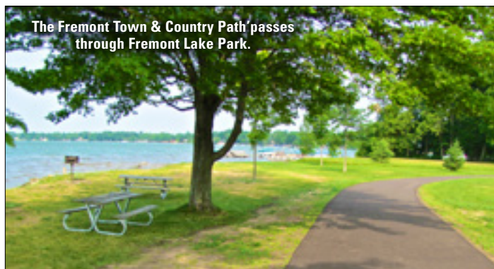
The Fremont Town & Country Path passes through Fremont Lake Park.