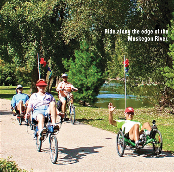
Ride along the edge of the Muskegon River.