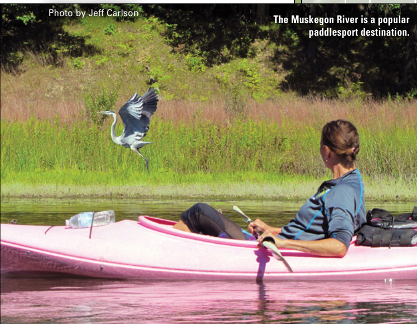
The Muskegon River is a popular paddlesport destination.