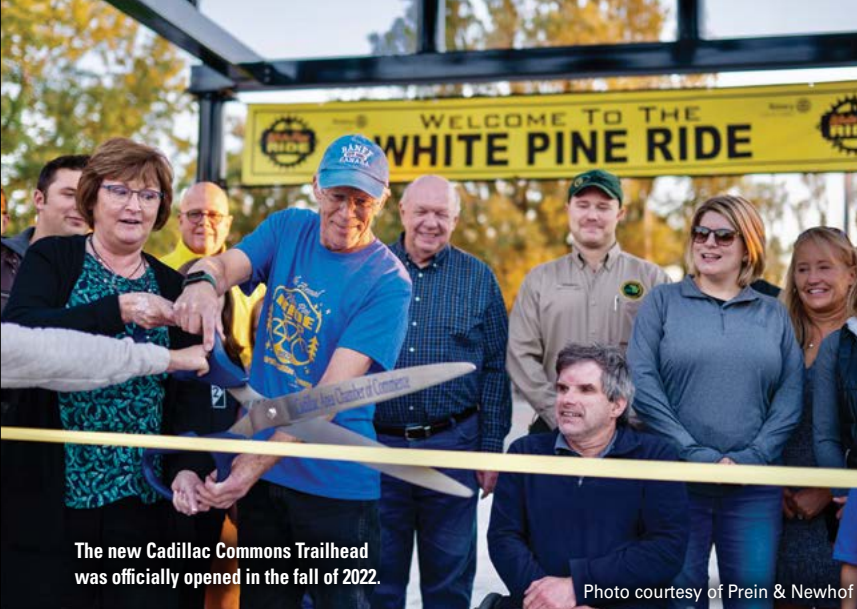
The new Cadillac Commons Trailhead was officially opened in the fall of 2022.