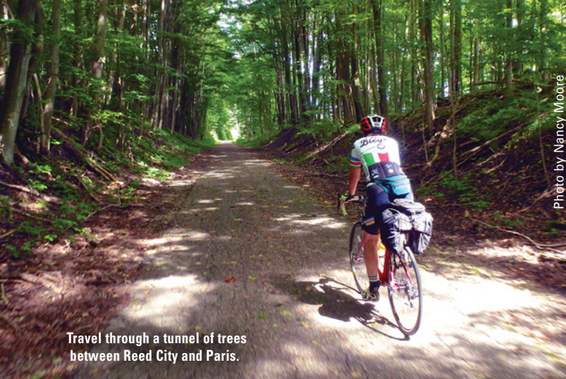
Travel through a tunnel of trees between Reed City and Paris.