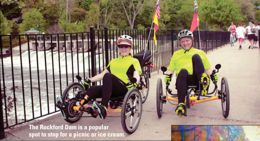
The Rockford Dam is a popular spot to stop for a picnic or ice cream.