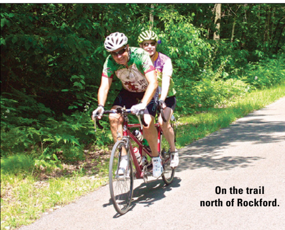
On the trail north of Rockford.