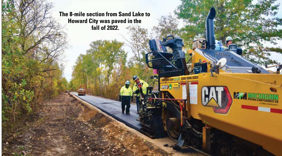
The 8-mile section from Sand Lake to Howard City was paved in the fall of 2022.