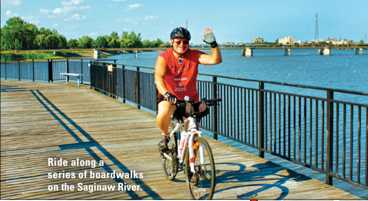
Ride along a series of boardwalks on the Saginaw River.