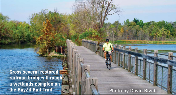
Cross several restored railroad bridges through a wetlands complex on the BayZil Rail Trail.