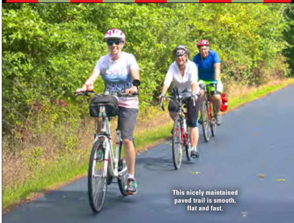
This nicely maintained paved trail is smooth, flat and fast.