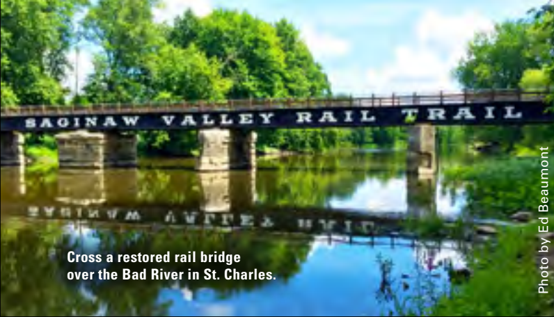
Cross a restored rail bridge over the Bad River in St. Charles.