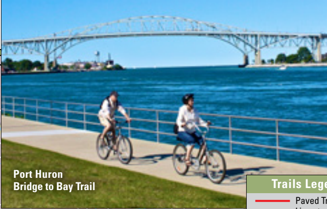
Port Huron Bridge to Bay Trail