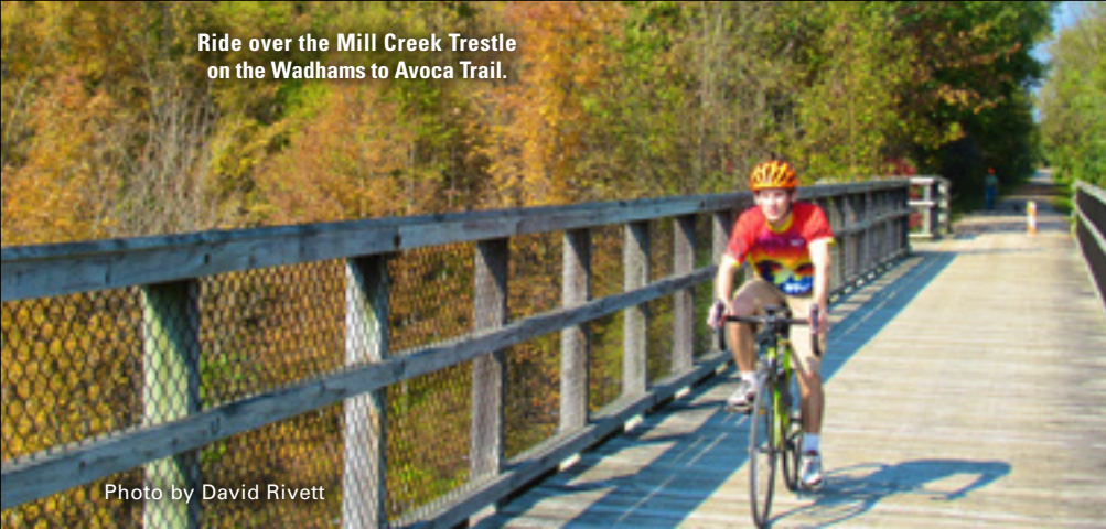
Ride over the Mill Creek Trestle on the Wadhams to Avoca Trail.

This fun paddle route passes by the Fort Gratiot Lighthouse, Lighthouse Beach and under the Blue Water Bridge. Be advised, the section under the bridge and along the St. Clair River can be more challenging with strong currents and the potential for rougher water conditions.