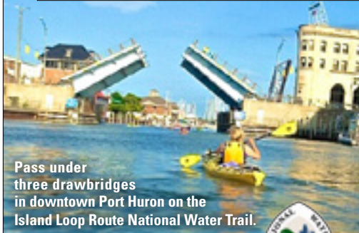
Pass under three drawbridges in downtown Port Huron on the Island Loop Route National Water Trail.