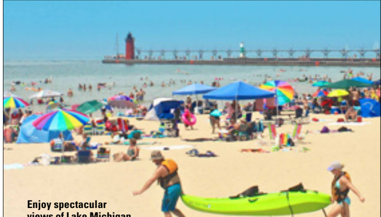
Enjoy spectacular views of Lake Michigan on the Kal-Haven Trail Scenic Connector Route.