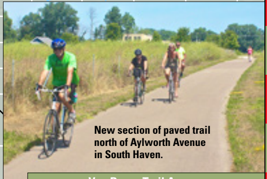
New section of paved trail north of Aylworth Avenue in South Haven.