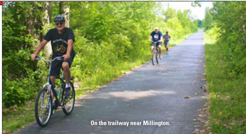
On the trailway near Millington.

The northern trailhead in Millington is at the south end of Gleason Street two blocks south of Main Street. Otter Lake's staging area is just off Payne Street, east of where Lake Road crosses the trail. The trailhead in Columbiaville is near Curley's Lakehouse Grill on Water Street. Horses are also allowed along the trail, but must follow easements adjacent to the pavement.