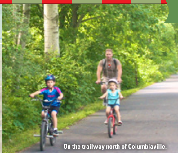
On the trailway north of Columbiaville.