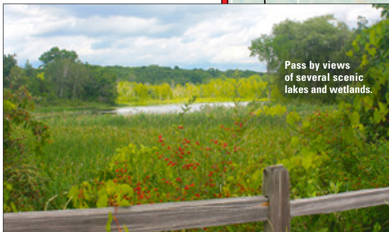
Pass by views of several scenic lakes and wetlands.

Otter Lake to Millington opening in 2010. You will appreciate the attention to detail in the trail construction with paved gravel road crossings and well-placed benches and picnic tables. The Southern Links Trailway Management Council, made up of local municipalities and townships, has earned a reputation for keeping the trail clean and nicely maintained.