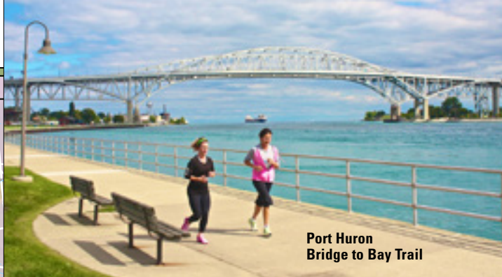
Port Huron Bridge to Bay Trail