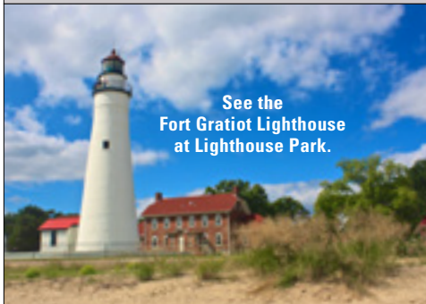
See the Fort Gratiot Lighthouse at Lighthouse Park.