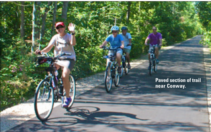
Paved section of trail near Conway.