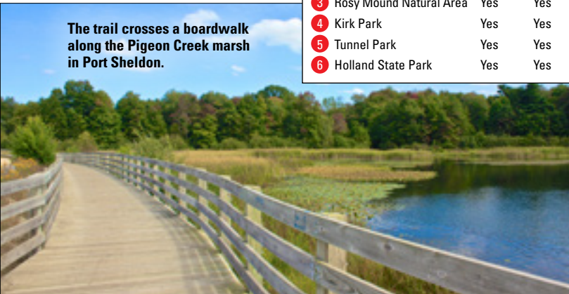
The trail crosses a boardwalk along the Pigeon Creek marsh in Port Sheldon.

foliage. Tunnel Park and Holland State Park are good access points if you would like to begin your trek from the south. At the north end of the trail, Rosy Mounds Natural Area is the best place to get on the trail. Kirk Park is a great midway point with a beautiful beach, nature trails, parking, restrooms, and picnic and playground areas.