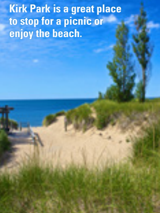
Kirk Park is a great place to stop for a picnic or enjoy the beach.