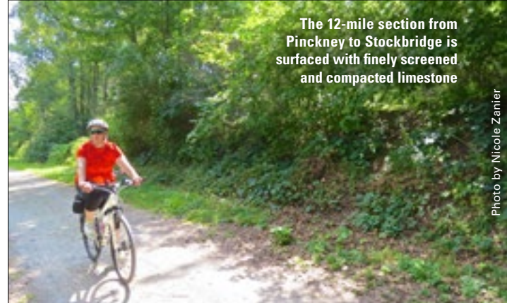
The 12-mile section from Pinckney to Stockbridge is surfaced with finely screened and compacted limestone

The trail includes 8 miles of paved asphalt trail, with an unpaved equestrian path, from the village of Hamburg to M-36 in Pinckney. The remaining 12-mile section of trail, from Pinckney to Stockbridge, is surfaced with finely screened and compacted limestone. This unpaved section is a very popular equestrian route. Cyclists should be cautious when approaching horseback riders so as not to "spook" the horses.