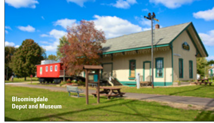
Bloomingdale Depot and Museum

Cyclists, runners and hikers will enjoy a peaceful journey past blueberry fields, cool canopies of trees, wildflowers, quaint villages, and over six bridges, including a covered bridge over the Black River near South Haven. The trail is mostly flat with some slight grades at each end.