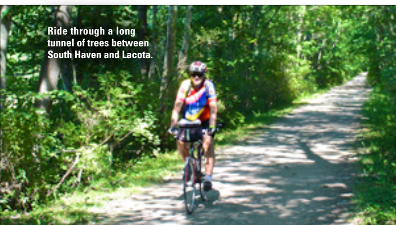
Ride through a long tunnel of trees between South Haven and Lacota.

The Kal-Haven Trail offers two top-notch trailheads. The 10th Street Trailhead near Kalamazoo, with its famous red caboose, is two miles north of West Main Street (M-43) and the US-131 intersection. The Bailey Street Trailhead in South Haven, perched on a bluff overlooking the Black River waterway, is located one block west of Blue Star Highway off Wells Street on Bailey Avenue. Staging areas in Grand Junction, Gobles and Bloomingdale are good halfway spots with local stores, restaurants and amenities.