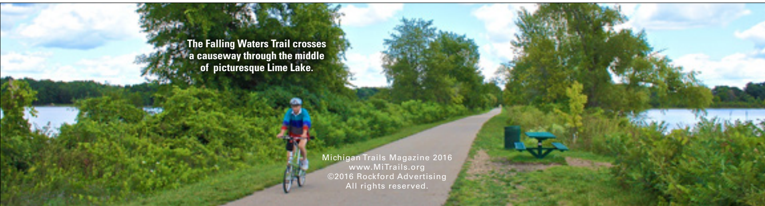
The Falling Waters Trail crosses a causeway through the middle of picturesque Lime Lake.

Dedicated in 2010, The Grand River ArtsWalk is a 1.5-mile multi-use trail that travels through Jackson’s growing arts and entertainment district. It’s also an important link in a long-range plan to build a continuous bike trail from South Haven to Port Huron. The current trail route begins where Cooper Street meets the Grand River. From there, continue west on Michigan Avenue and go north on Mechanic Street through the Armory Art Village (historic site of former state prison). Follow the paved path north along the banks of the Grand River.