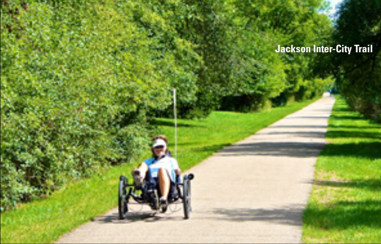
Jackson Inter-City Trail