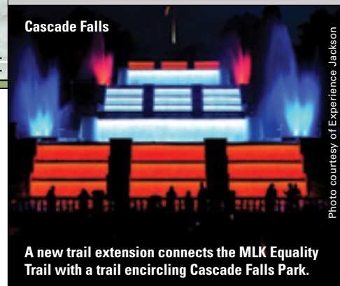
A new trail extension connects the MLK Equality Trail with a trail encircling Cascade Falls Park.

The Grand River Arts-Walk is a 1.5-mile non-motorized trail that travels through