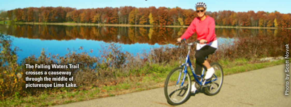
The Falling Waters Trail crosses a causeway through the middle of picturesque Lime Lake.

Jackson's growing arts and entertainment district. The current trail route begins where Cooper Street meets the Grand River. From there, continue west on Michigan Avenue and go north on Mechanic Street through the Armory Art Village (historic site of former state prison). Follow the paved path north along the banks of the Grand River. The Michigan DNR is currently working on a plan to extend the trail along the Grand River to connect with the Michael Levine Lakelands Trail State Park in Munith.