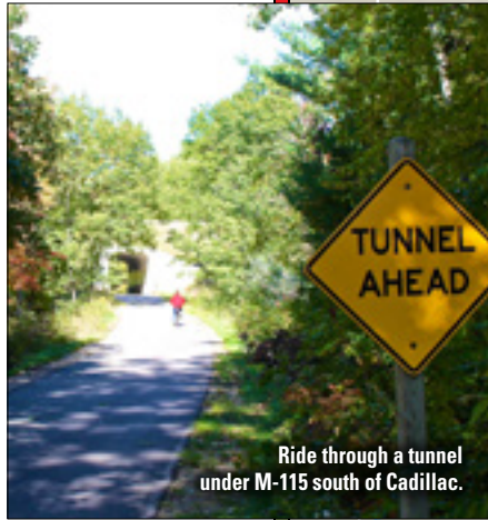
Ride through a tunnel under M-115 south of Cadillac.

From Tustin to Cadillac, the trail enters the Rose Lake watershed, crossing a wide expanse of open wetlands with plenty of opportunities to view birds, waterfowl and other wildlife. Further north, you'll travel through another wetland complex of ponds, bogs, and cedar and tamarack swamps. Several beaver lodges can be seen along the edges of the ponds and wetlands. After passing under US-131, the trail begins a steady climb to higher ground. The White Pine Trail ends (or begins) at Waterfront Park in downtown Cadillac, where you'll find an excellent staging area and plenty of stores, lodging and restaurants. The 28-mile round trip from Cadillac to LeRoy (14 miles) and back is a popular day trip.