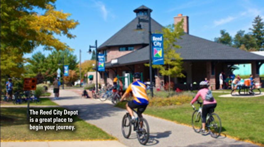
The Reed City Depot is a great place to begin your journey.