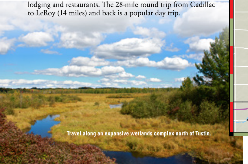
Travel along an expansive wetlands complex north of Tustin.