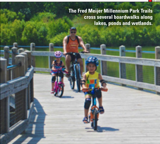
The Fred Meijer Millennium Park Trails cross several boardwalks along lakes, ponds and wetlands.

Known for its swimming beach, splash park, fishing docks and huge playground, the park also includes an extensive network of nearly 20 miles of paved bicycle paths and improved nature trails. This network of trails guides you through the park's natural features and along several lakes, ponds and wetlands teaming with wildlife, waterfowl and migratory birds. A series of new trails and a boardwalk, plus a new parking area, pavilion and amphitheater, were added to the park in 2016 on the east side of Maynard Avenue.