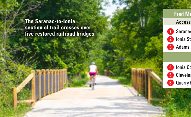
The Saranac-to-Ionia section of trail crosses over five restored railroad bridges.