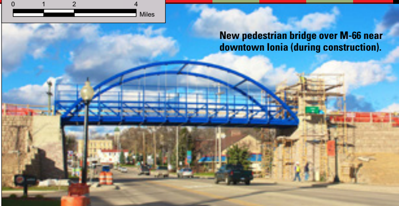
New pedestrian bridge over M-66 near downtown Ionia (during construction).

The first 8.25 miles of trail from Saranac to Ionia was completed in 2013. This exceptionally scenic section of trail travels along the edge of the Grand River and through the Ionia State Recreation Area, with no road crossings, for a peaceful, serene commune with nature. It also includes an amazing five restored railroad bridges, including one towering bridge spanning 466 feet across the mighty Grand River. Trail users have reported a lot of wildlife sightings along this stretch of trail, including whitetail deer, turkey, great horned owls, eagles, a wide range of waterfowl, and even the rare pine marten.