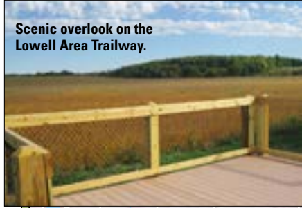
Scenic overlook on the Lowell Area Trailway.