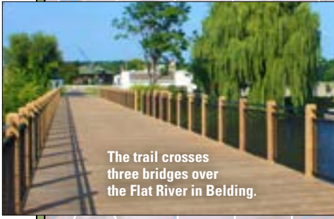
The trail crosses three bridges over the Flat River in Belding.